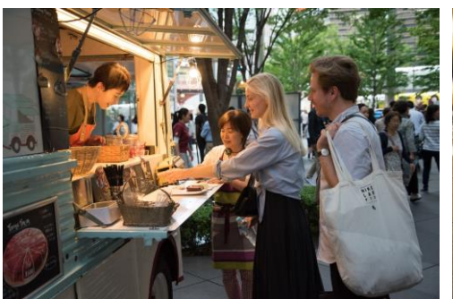
Various Food trucks