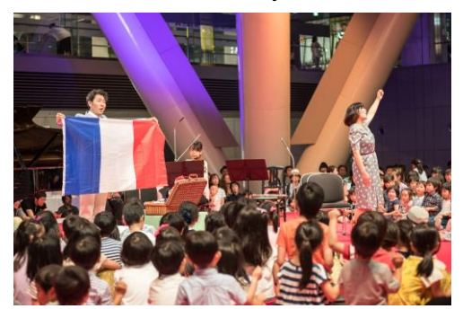
Children and Music (Workshops)