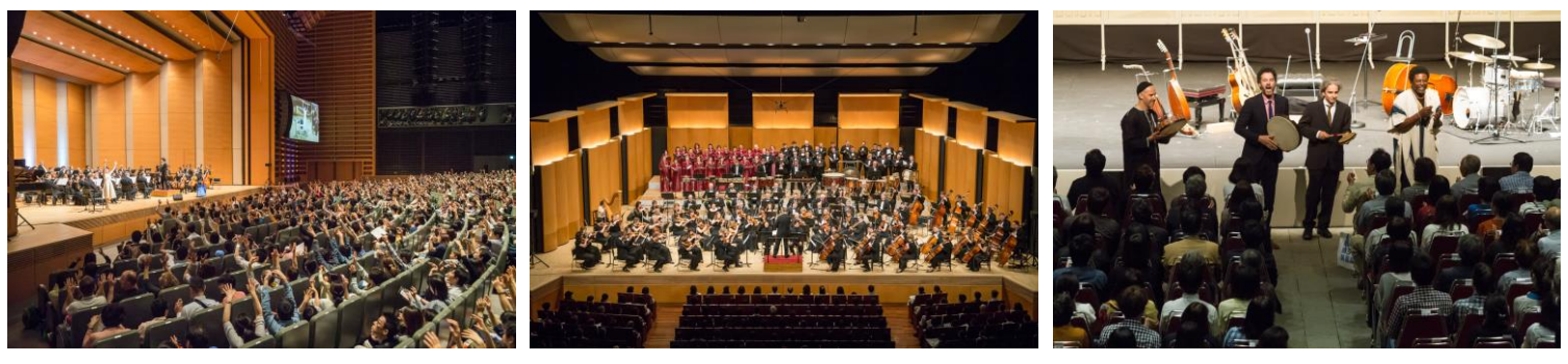
Hall A Concerts from 0 years old